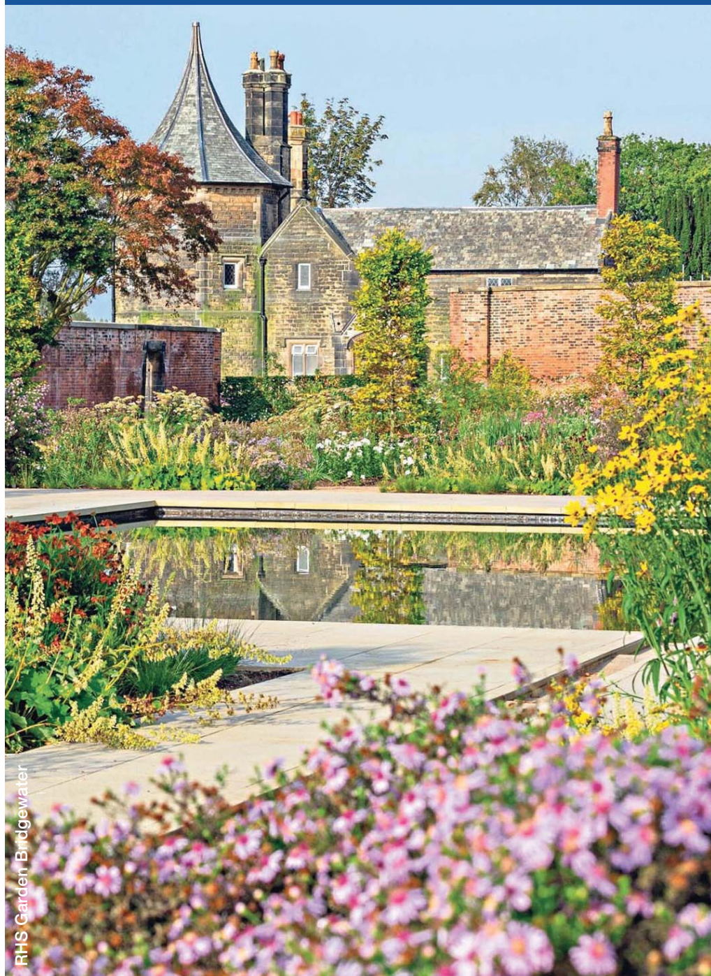
RHS Garden Bridgewater