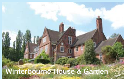
Winterbourne House & Garden