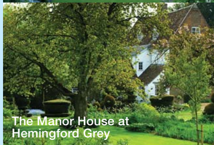
The Manor House at Hemingford Grey