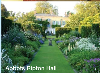
Abbots Ripton Hall