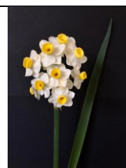
Class 4 1 st Chin Fenton