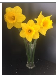
Class 2 1 st Ravi Kudhail