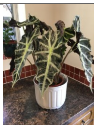
Class 13 Joint 1 st Roy/Moiya Stroomer