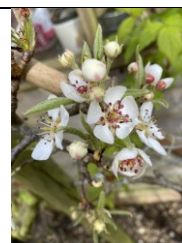
Class 17 Joint 1 st Briony Wickenden

2 nd and 3 rd places can be found on our website https://www.csgga.org/virtual-spring-show-winning-entries.html